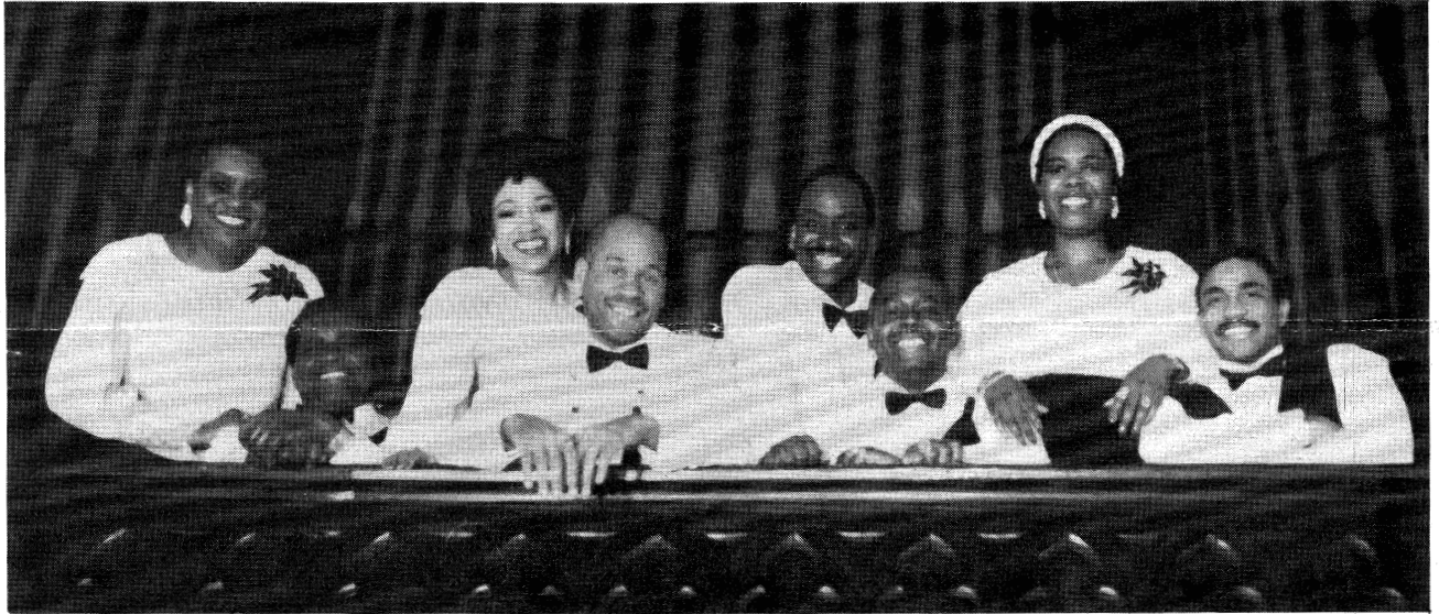
Harlem Spiritual Ensemble January 9, 1996 (Tuesday)

ADMISSION LIMITED TO MEMBERS ONLY - NO SINGLE ADMISSIONS SOLD MEMBERSHIP CARDS WILL BE MAILED PRIOR TO THE JANUARY CONCERT.