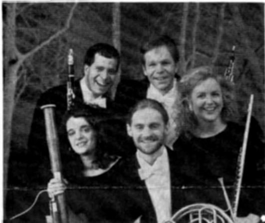
Aspen Wind Quintet February 12, 1996 (Monday)

From the Trinity Lutheran Church in New York City, this group is devoted to the preservation of the American Negro Spiritual. Faithful to the original interpretations of the spiritual, the Ensemble brings to life the vital spirit expressed in these songs.