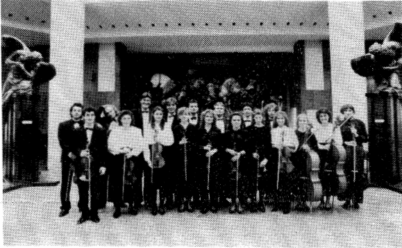
HUNGARIAN VIRTUOSI ORCHESTRA - STRINGS

ADMISSION LIMITED TO MEMBERS ONLY - NO SINGLE ADMISSIONS SOLD DATES OF THE MONTHLY CONCERTS WILL BE LISTED ON YOUR MEMBERSHIP CARDS WHICH WILL BE MAILED PRIOR TO THE FIRST CONCERT